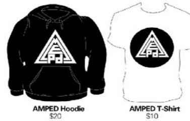
AMPED Hoodie $20

Pre-Order your AMPED apparel by January 1st and be one of the 1st to own these!